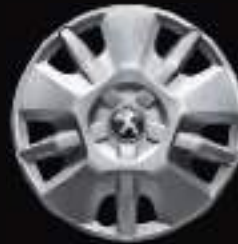
15" wheel trim on Light version