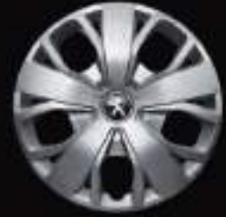
16" wheel trim on Heavy version