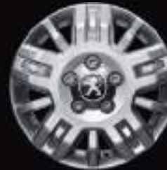
15" alloy wheel on Light version