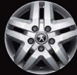
16" alloy wheel on Heavy version